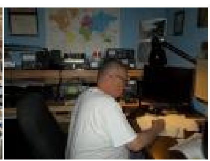
Ham Radio Operators providing critical communications – ground level, in the air and net control

Kentucky – Indiana – Ohio Tornado Outbreak March 2, 2012