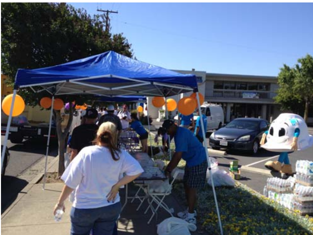
2012 March of Dimes Walk – PGE sponsored rest stop