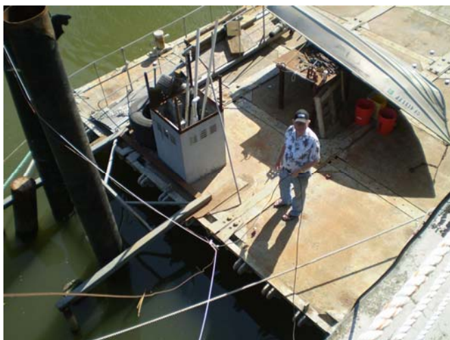
THE VIEW FROM THE 20-METER BEAM