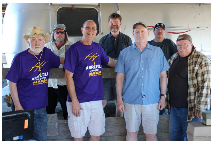
Field Day 2014