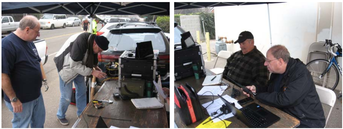
Paul N6KZW works on Net Control

Early morning was cool with no wind and even a bit of fog hugging the foothills east of Linden. We started set-up at 7 AM next to DeVinci's Deli in downtown Linden. Net control used Dave N6LHL 's 2-Meter Vertical and push-up pole on the Lodi Club repeater 147.090 MHz.