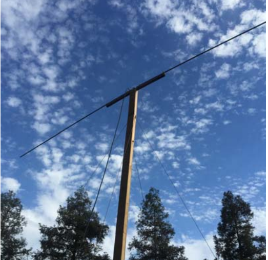
Portable Dipole from N6TCE

Sign up for the next HamCram of Licensing by clicking the link here.