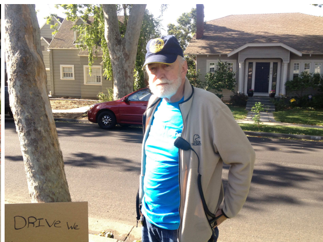
Shirl AA6K at Rest Stop 1