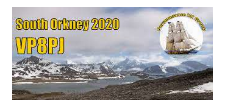
QSL CARDS ARE BEING PROCESSED https://m0urx.com/oqrs/logsearch.php

Please check back in early 2021 for updates.