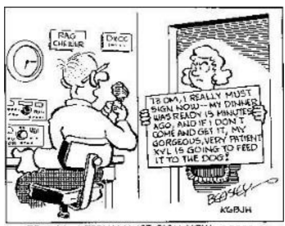
-75 O.M., I REALLY MUST SIGN NOW - ----