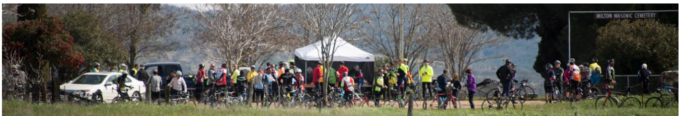
PPIB Ride – Milton Rest Stop