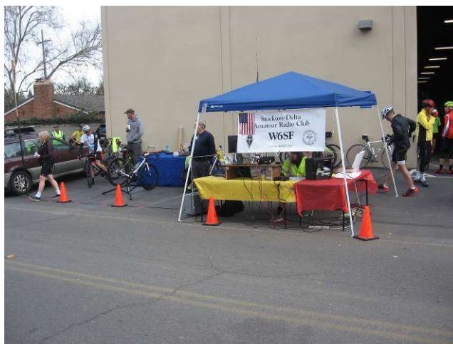
NCS Set-up at DeVinci's in Linden